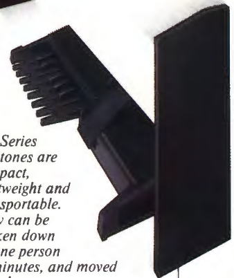
ME Series Electones are compact, lightweight and transportable. They can be broken down by one person in minutes, and moved anywhere.