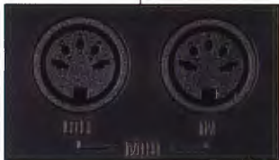
The MIDI interface gives you almost unlimited expansion potential.

Vibrato and Sustain features are preset, but you can program their parameters with the Multi-Menu.