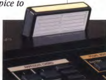
The ME-50's RAM Pack system gives you virtually infinite capacity to store your registrations and C.S.P. data.